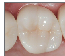
BruxZir 3Y 2009 Initial Placement

Over 200 tooth-colored materials have been studied clinically by this lab over the last 40+ years. The current study includes 20 materials at various stages of clinical service ( see listing on page 2 ). The materials differ in many aspects, but all are tooth-colored, monolithic, CAD-CAM fabricated either by commercial labs or in-office; all were recommended for single units anywhere in the oral cavity when entered into this study; and all study restorations are full-contour crowns on molars.