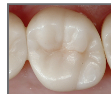
BruxZir 3Y At 8 Years (Note loss of glaze)